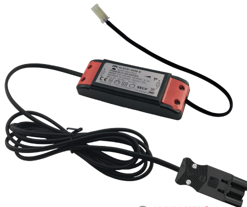
G 16.8101.0350.G GST18 3 POLE