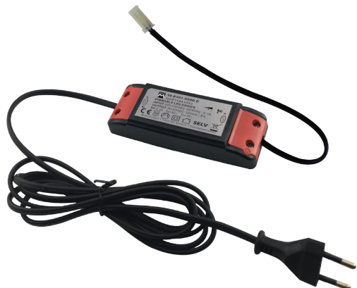
E 16.8101.0350.E EUROPLUG