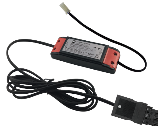
W 16.8101.0350.W WINSTA 3 POLE