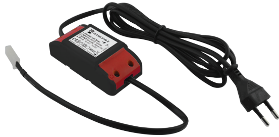
E 16.8100.0160.E EUROPLUG