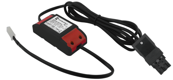
W 16.8100.0160.W WINSTA 3 POLE