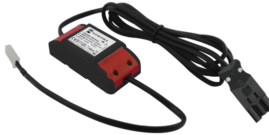
G 16.8100.0160.G GST18 3 POLE