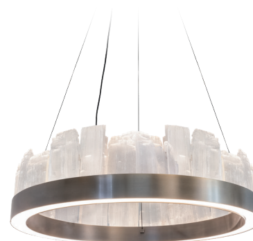
13.0216.03 Blakes chandelier Ø900mm