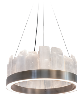
13.0212.03 Blakes chandelier Ø600mm