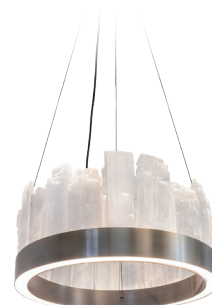
13.0208.03 Blakes chandelier Ø400mm